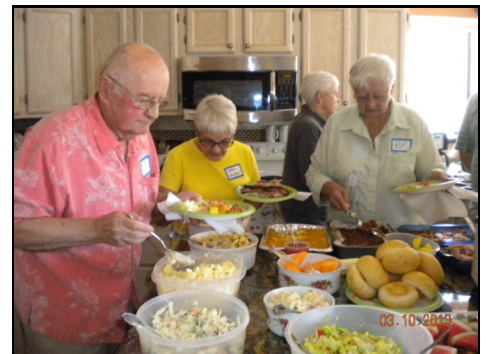
It's Chow Time... yum!